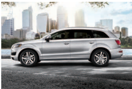
Body-color lower body paint finish with chrome accents