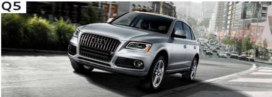
2015 Audi Q5 2.0T Premium shown with xenon plus headlights