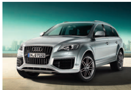
Sport Style plus package