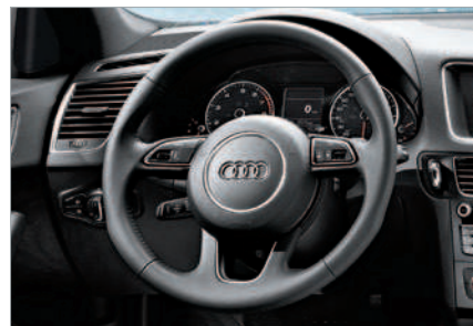
Three-spoke steering wheel