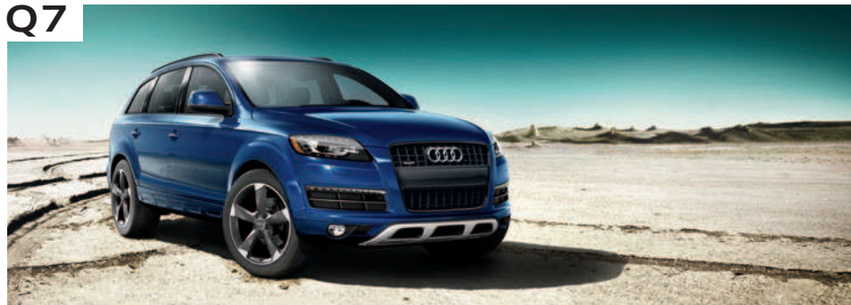
2015 Audi Q7 Premium Plus shown with Offroad Style plus package