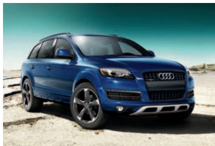
Offroad Style plus package

Standard on 3.0T Premium and Premium Plus